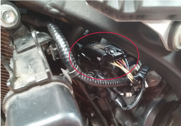
Pic.1 - location of 6way connector from Ignition coils

Connect QS sensor to QS wiring harness - black 2 pin connector.