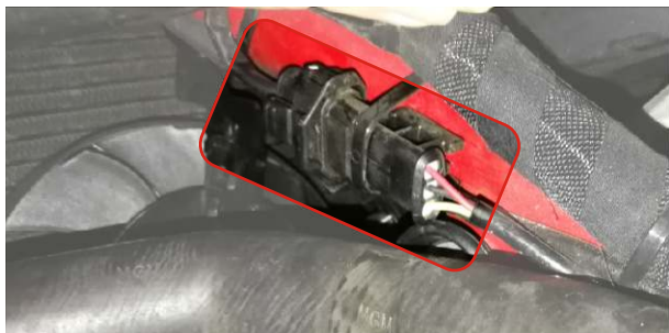
Ignition coil connector

Disconnect 3way connectors from both ignition coils and insert connectors from QS wiring harness.